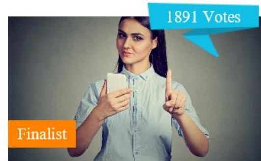
Respekt – Mein Style im Netz!