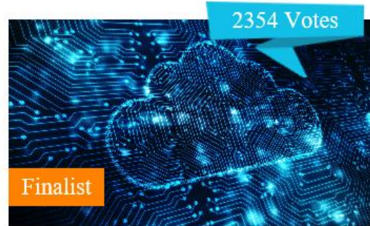
Cyber Security – Aber wie?