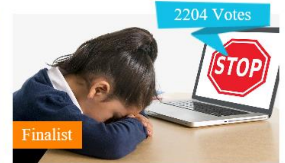
KLEIN mit großer Verantwortung